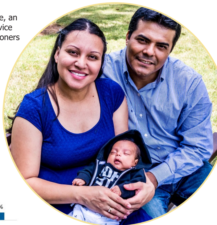
FY 20-21 Ethnicities of Clients and Direct Service Staff

ARCC's staff is culturally diverse and reflective of the communities we serve, an intentional result of our hiring practices. Overall, 87% of ARCC's direct service staff is ethnically diverse and 65% are bilingual. Additionally, many practitioners have lived through the types of experiences their clients are working to overcome. This shared life experience – coming from a low-income family, being a first generation immigrant, raised by a single parent, recovering from substance abuse – helps build a sense of trust almost immediately, facilitating therapeutic progress and positive outcomes.